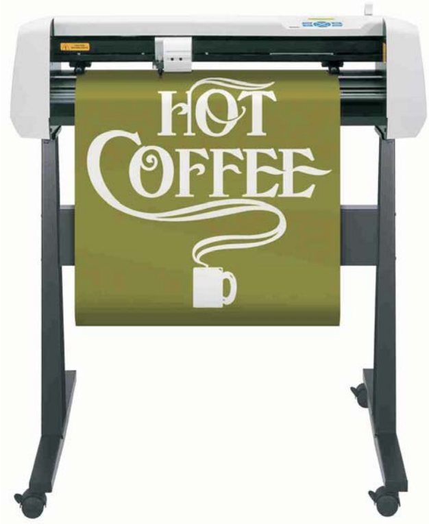
24-inch D60 Desktop with optional stand