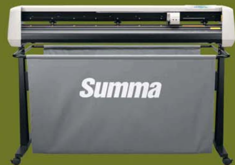
48-inch D120 SE

New SummaCut SE models come equipped with deluxe stands and adjustable front and rear media baskets, plus our new OPOS 2.0 optical positioning system for auto-alignment of printed vinyl graphics.