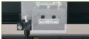
Powerful D-Series cutting head uses up to 400 grams of down-force.