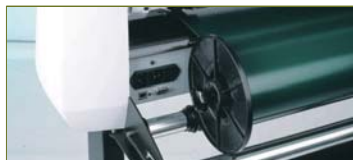
Adjustable media rollers and media roll-end flanges keep your vinyl on-track.